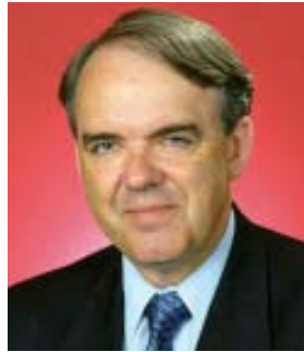
Senator the Hon. Rod Kemp, Minister for the Arts and Sport

A governance chart for the Archives, current at 30 June 2005, is shown at Figure 1.