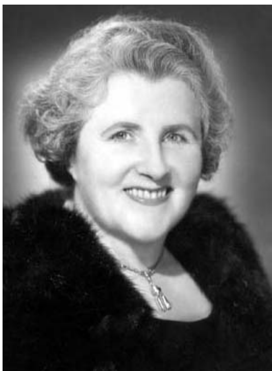
Enid Lyons, politician, nd.