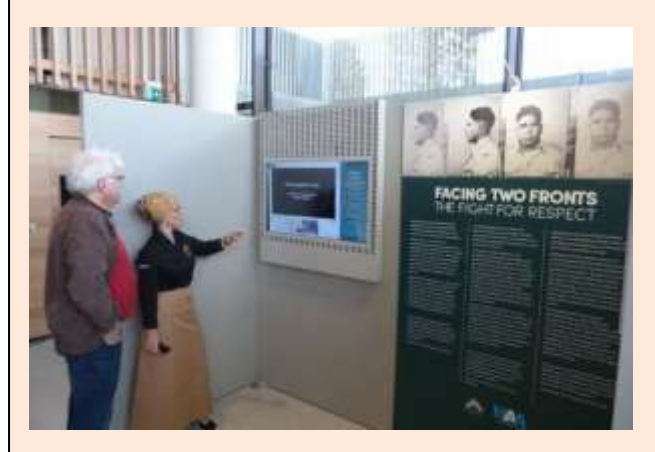
The Facing Two Fronts on display for the Centenary of the Armistice, at the Sir John Monash Centre, located at Villers Bretonneux, France, November 2018

This digital exhibition featured extraordinary images, stirring video portraits, and original records from the Archives' Darwin collection and the Northern Territory Archives Service.